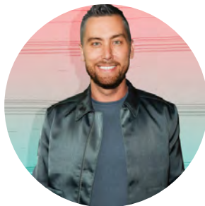
Lance Bass *NSYNC

I almost killed my mother's dog on Christmas with weed!